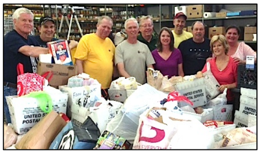
Volunteers unloaded nearly 9000 lbs. of food for the Post Office Stamp Out Hunger Food Drive in May

Help join the fight to end hunger here in your own hometown by donating $$$ or hosting a food drive for FISH! Be sure to check our website for more ideas as well as our FISH Fundraising Kit . No donation is ever too small. What you give can make a huge difference to someone in need. Donating is as easy as a click of a button on our website, www.fishofmchenry.org .