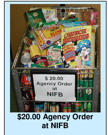
$20.00 Agency Order at NIFB

FISH Food Pantry is pleased to announce that we have finally partnered with Northern Illinois Food Bank which allows us to get much more for YOUR donation money! In addition, FISH will also be receiving the FREE government commodities for emergency assistance available to McHenry County. We are currently hoping to obtain freezers and refrigerators in the near future so that we can access the meats, dairy products and produce also offered by the NIFB. We thank our very generous community for the continued support to help us reach these goals and serve our neighbors in need!