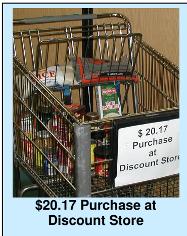
$20.17 Purchase at Discount Store