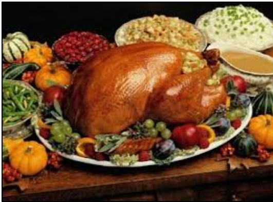
Each Holiday Meal Box from NIFB costs FISH $16 and feeds up to 8 people - that is the equivalent of just $2 per person.