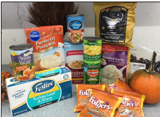
Each Holiday Meal Bag contains a 2 lb. Turkey Roast, Corn, Green Beans, Instant Potatoes, Gravy, Stuffing, Broth, Dried Cherries, Canned Pumpkin, Dessert & Coffee.

Hunger never takes a holiday. Once again, FISH will be offering each household 2 choices of a complete holiday meal for Thanksgiving. Through our partnership with Northern Illinois Food Bank, we can obtain a frozen 12-14 lb. turkey plus a pre-packed box that includes all of the trimmings for an entire holiday meal for a fraction of the retail cost. Each Holiday Box is valued at over $40 but FISH of McHenry's cost is only $16.